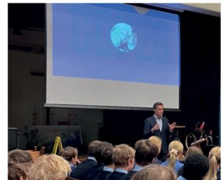
Mr Max Foster, CNN Reporter