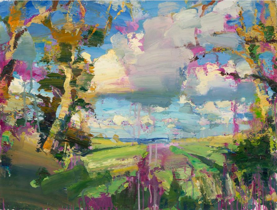
“Charity Field”, oil on canvas, by OLIVER AKERS-DOUGLAS

Living in Wiltshire, Oliver is known for his dramatic landscapes, from the Wiltshire hills to the wilds of Scotland, Connemara, the Hebrides and, more recently, the Swiss Alps. He likes to work en plein air. Using oils applied with a pallet knife, he builds up a highly textured pigment to capture romantic billowing clouds or dramatic changes of weather.